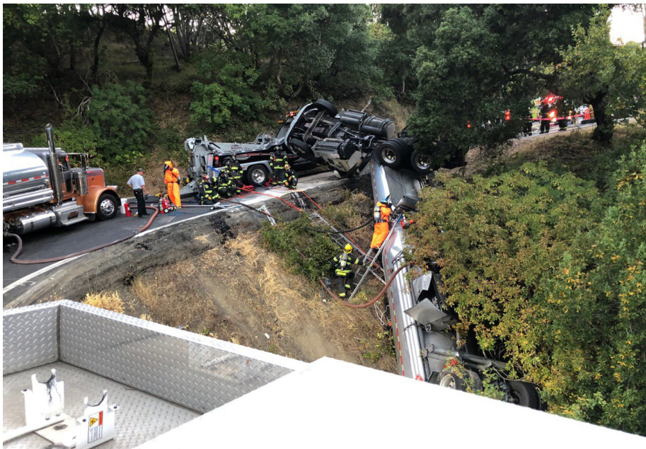
Stinger operation performed by Contra Costa Health Services, hazardous Materials Programs in response to an 9,000 gallon overturned gasoline tanker during a mutual aid for the Marin County JPA HazMat team.

The Nation's Leading Hazardous Materials Emergency Response